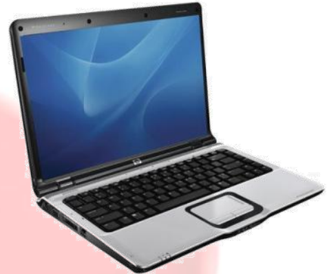
Unique Software Systems

Our website and call centre handle enquires generated by various proven marketing activities, such as radio advertising, Insurance Works themed taxis, internet advertising and newspapers – to name just a few.